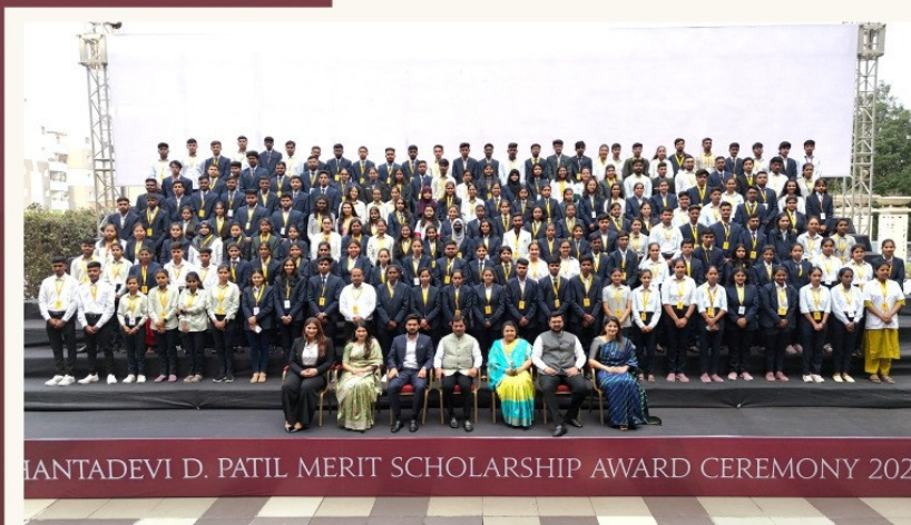
SOU. SHANTADEVI D. PATIL MERIT SCHOLARSHIP AWARD CEREMONY 2024